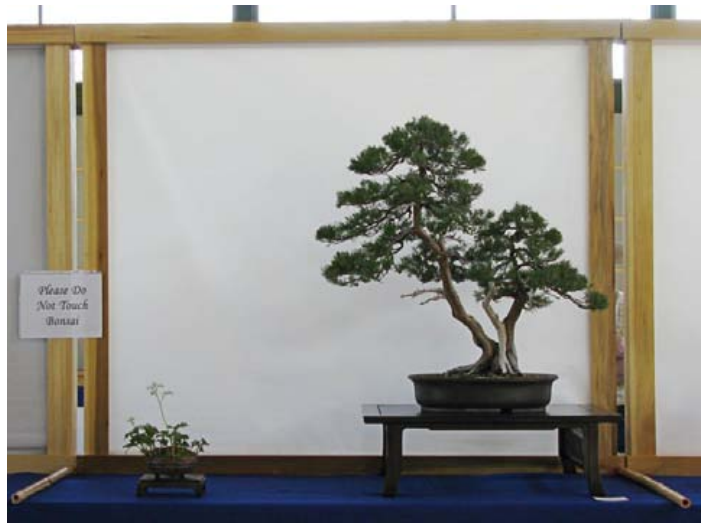
2nd runner-up. Lemon Hill Juniper.