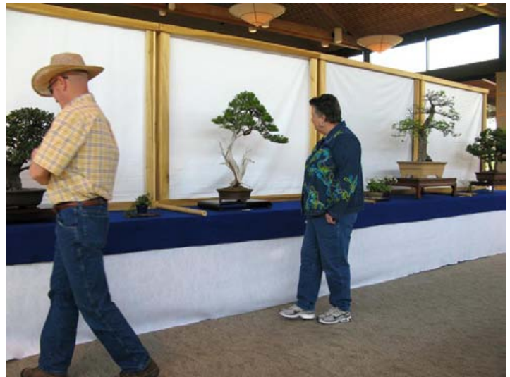
Sunday afternoon visitors.