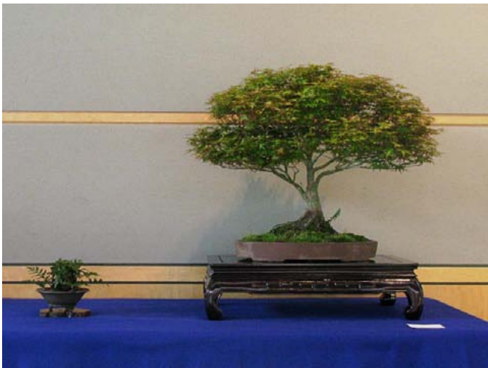
1st runner-up. Kiyohime maple.