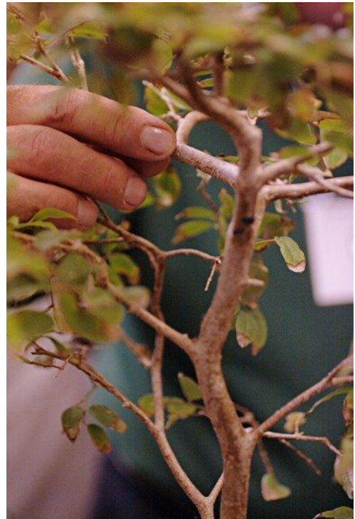
Selecting branches.