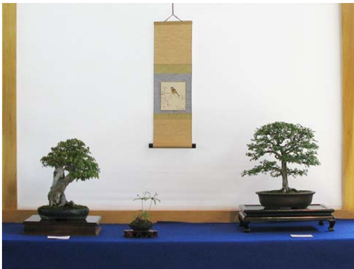
Trident maple and Catlin elm.