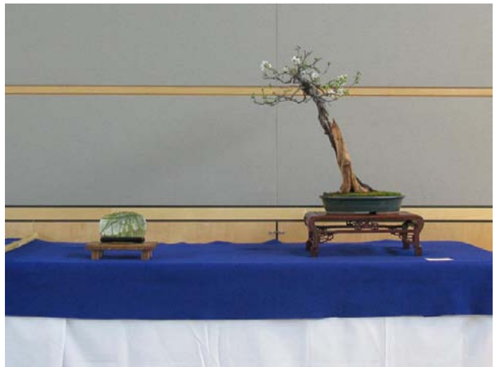
Prunus (Wild cherry).