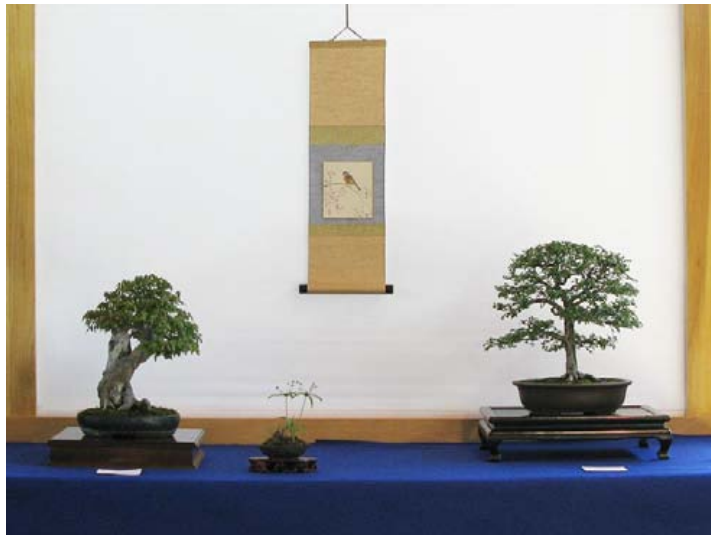
Trident maple and Catlin elm.