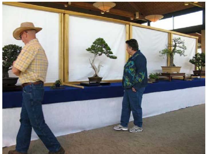
Sunday afternoon visitors.